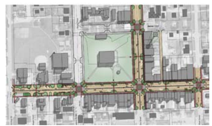
Streetscape improvements plan view

The lowa Green Streets Pilot Project is a community -wide sustainability initiative to serve as a catalyst for further investment in the historic downtown of West Union, Iowa. The project began with a visioning workshop in October 2007 when Iowa's Department of Economic Development (IDED) completed a Technical Assistance Visit to advise West Union about the potential for multipurpose pedestrian-scale streetscape improvements. The result of the initial visioning and the subsequent Conceptual and Schematic Planning was a Streetscape Master Plan, which has led the Pilot Project, now in the construction documentation stages.